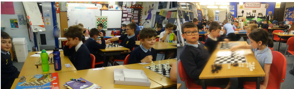
Figure 5: A typical busy chess club session