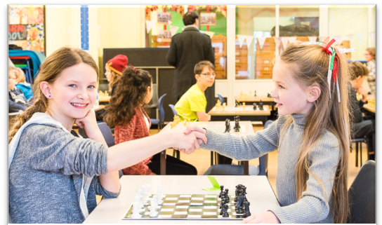
Figure 1: Sportsmanship is a core value of the club

We have always set high expectations within the club and students must commit to attend regularly and to demonstrate the highest standards of sportsmanship.