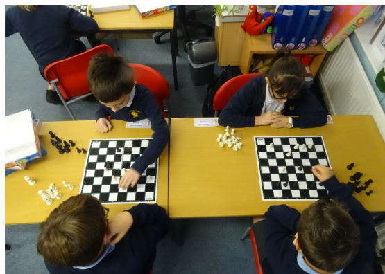
Figure 6: Four new players playing 'pawn only' game