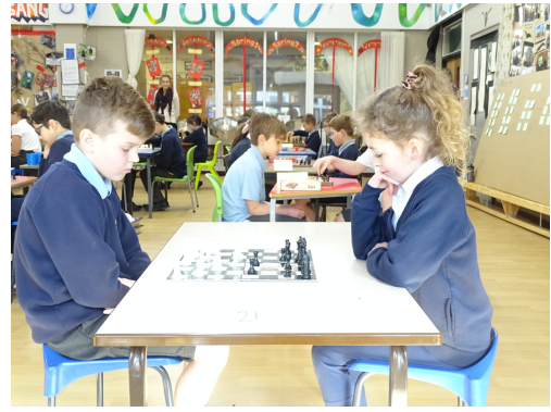
Figure 9: Concentration is the key!