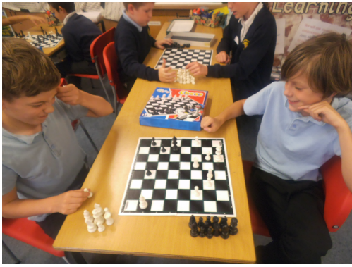
Figure 8: Black realises it has not gone to plan...